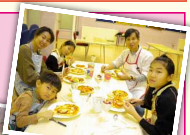
Family Cooking Kirkton Community Centre