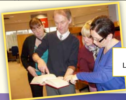
St Mary's Local History Group