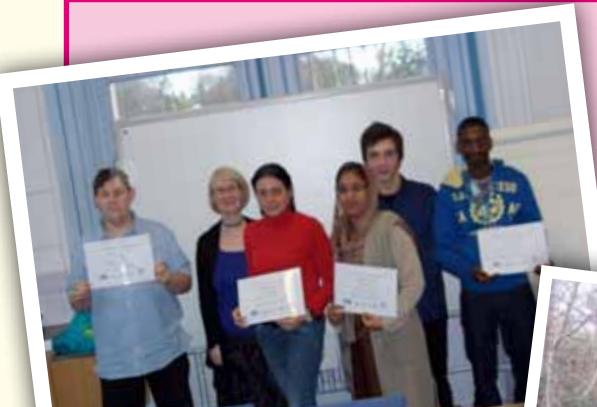
Just the Job Mitchell Street Centre

To find out what is available in your area call 666665.