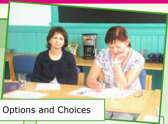
Options and Choices

Below are a variety of courses that will help with this. To book a place, see full contact details below in the listings.