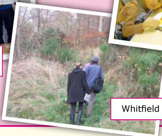
Whitfield Environment Group